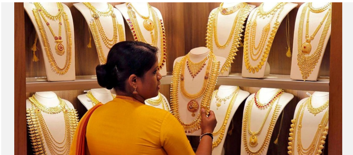
A saleswoman picks gold necklaces to show to a customer inside a jewellery showroom on the occasion of Akshaya Tritiya, a major gold buying festival, in Kochi, India, May 7, 2019.

The case for gold is a little different. Over the last 10 years, during 2021, India witnessed the largest amount of gold imports. Inflation may be a reason for this. Gold is seen as a hedge against inflation. Most of the gold imported is meant for domestic consumption, with a little element of intra-industry trade.